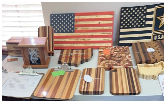
Sample of items for sale from the Skill Center.

Connect with DKG NATIONAL: www.dkg.org STATE: www.dkgohio.org LOCAL: http://www.deltakappagamma.org/OH-alphaeta/